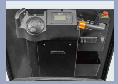
Control and display panel integrated are perfectly in the drivers field of view