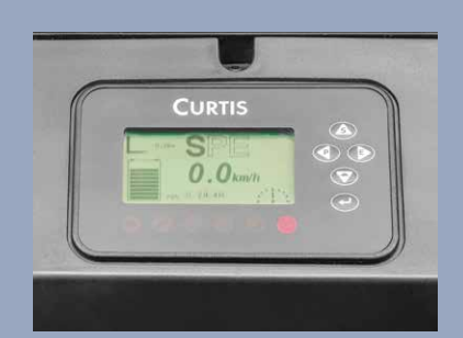
Standard LCD display informs the driver about a necessary informations