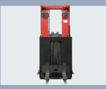
Supplementary lift on operator platform. Pallet can be raised to most convenient working leve for picking