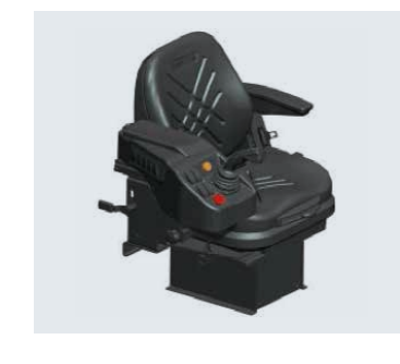
Suspended seat with fingertip system that can be easily adjusted to suit each customer.