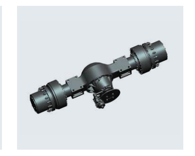
Heavy-duty traction axle, two-stage deceleration; Wet brake, maintenance-free; Hydraulic release spring action parking brake, safe and reliable.