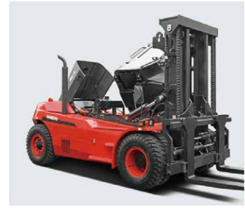
Thanks to the unique design, cab can be tilt without any tools, major service items can be reached easily by tilting the cabin, maximized access is possible.