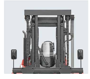
Excellent all round visibility is achieved by the overall design.