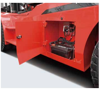
Battery compartment is easy to open for easy maintenance.