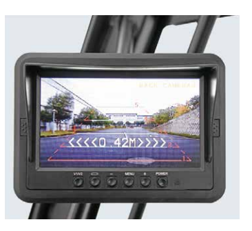
Optional imaging system with front and rear camera, increasing the safety greatly.