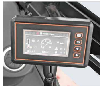
The newly designed LCD instrument has more comprehensive functions and more stable performance. It can display the important information such as truck status and engine faults... So that the operator can understand the truck status more intuitively and facilitate maintenance.